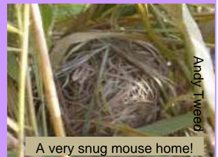
A very snug mouse home!

In recent weeks we have planted a further 400 trees around the centre gardens to provide extra habitat for the myriad of wildlife we are already attracting. The first bulbs are already pushing through to fool us into thinking Spring is on the way.