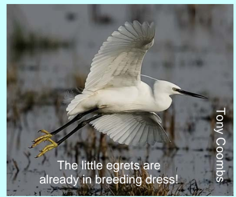
The little egrets are already in breeding dress!

What's been about: January: New Year's Day saw 87 species recorded on the marsh including two site rarities in the shape of a coal tit and a lesser spotted woodpecker . The latter was only the second record for the reserve and was seen again on the 8 th . Our two showy penduline tits stayed till the 14 th and attracted a steady stream of visitors. Bearded tits were seen most days with up to four present while two different Dartford warblers were seen on the 1 st and 8 th . At least two blackcaps and six chiffchaffs are wintering and a very pale chiffchaff of one of the eastern races has been cause for much discussion. Cetti's warblers