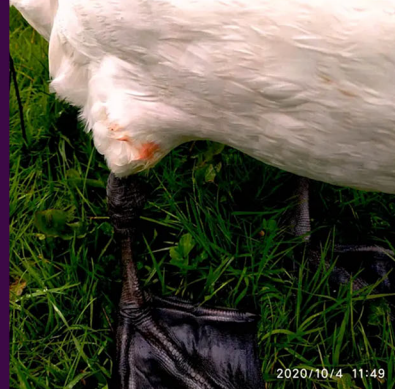
This photo shows the injury sustained by a swan at the site in 2020 which required medical attention

You do not have to live in Harrow to respond and please share this as widely as you can in order to help Harrow Council and its commitment to Government biodiversity guidelines here: https://www.gov.uk/guidance/complying-with-the-biodiversity-duty