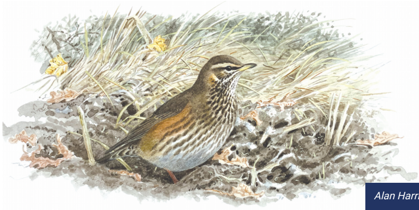
'Icelandic Redwing' Turdus iliacus coburnii