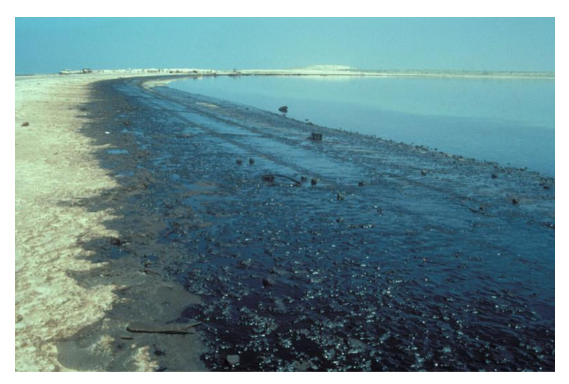
tion id="attachment_574712" align="aligncenter" width="1000"] Oiled beaches in Kuwait, April 1991.

Syria and Iraq have few birdwatchers, but I have had the privilege of joining them many times. After the removal of Saddam, in 2003, a conservation movement blossomed, spear-headed by Nature Iraq, an NGO that would not have been allowed under the previous regime. Their first project was a six-year survey to identify the country's important wildlife sites and I was chosen to train their young biologists on behalf of BirdLife International. It wasn't deemed safe to be in Iraq so Syria was to be the training ground, with its large wetlands and deserts that would simulate two of Iraq's major habitats. For five years we gathered annually in Syria until, once again, conflict intervened.