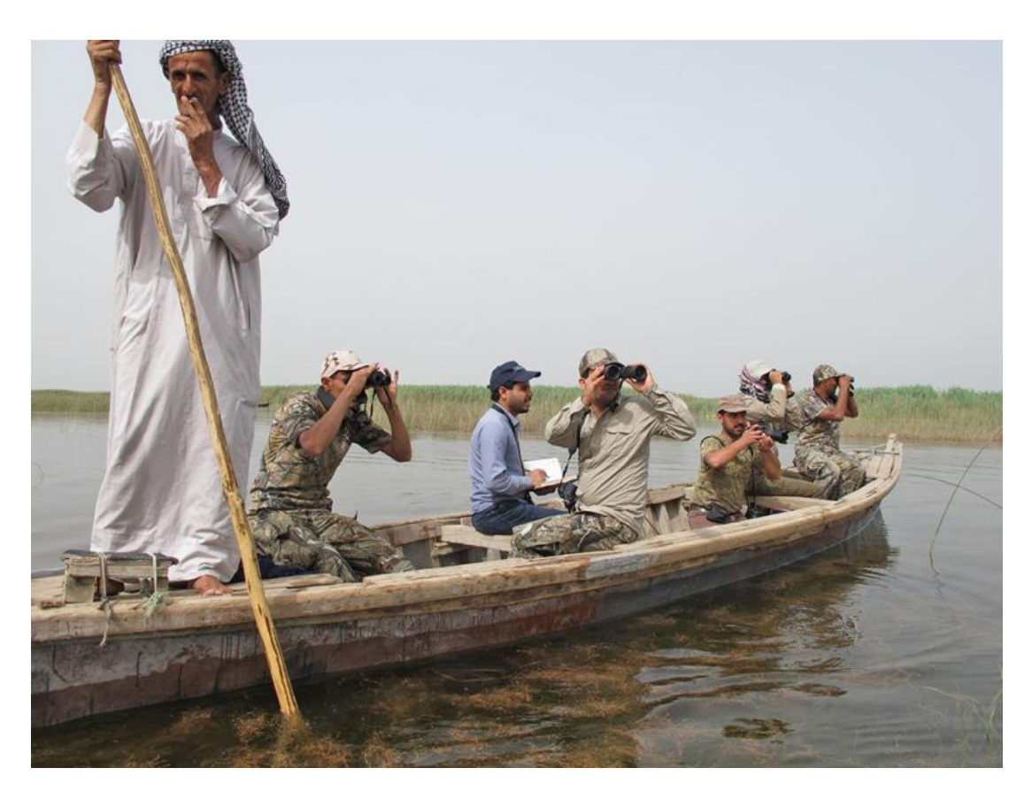
tion id="attachment_574713" align="aligncenter" width="1000"] Training in Iraq's Mesopotamian Marshes, April 2013.

So, for the next six years, training courses and survey reviews were held in Iraq, although not before three of my Iraqi colleagues were kidnapped and held to ransom in the Marshes. On my last visit, in spring 2013, when tensions persisted, it was unsettling to know that rifles were at the ready for the unexpected while we were censusing White-tailed Lapwings Vanellus leucurus . Yet despite everything, Nature Iraq has produced a field guide in Arabic; recently published its endeavours in the monumental Key Biodiversity Areas of Iraq , and celebrated the re-flooding of the Mesopotamian Marshes with a festival on the Euphrates that ended with a boat race!